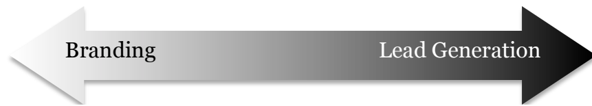
Figure 2 - The False Choice between Marketing Tactics

Specifically, it helps to note that many marketing professionals differentiate the tactics that are available for B2B marketing according to where they fall on the spectrum of “lead generation.” That is, some marketing tactics are explicitly designed to produce qualified appointments (e.g. cold calling), while others are designed just to create awareness (e.g. branding) and leave the responsibility for generating appointments to someone (or something) else. We think this differentiation, however popular in the industry, sets up a false choice. And it’s one that gets a lot of people into a lot of trouble, right from the get-go.