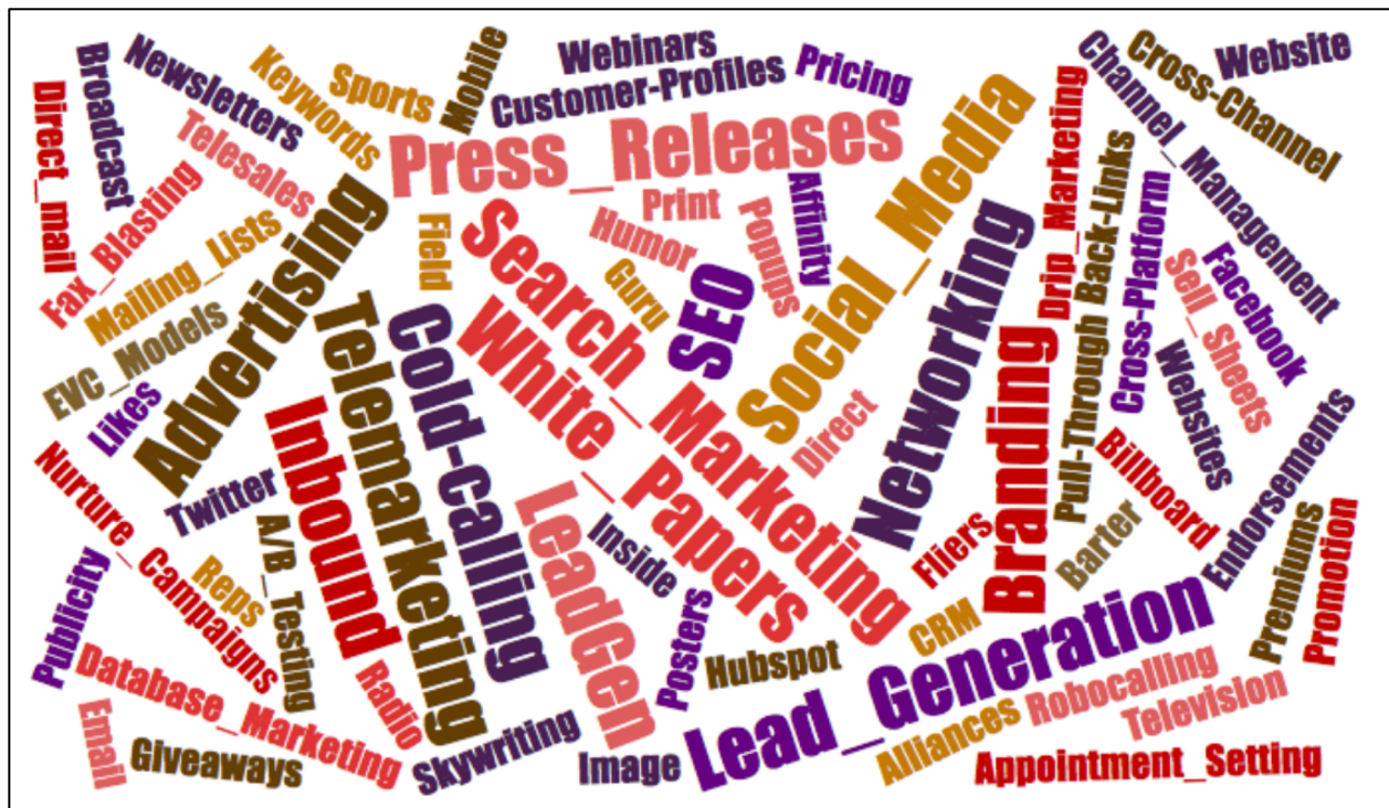
Figure 1 - A Few of the Hundreds of Tactics Available for B2B Marketing

Whether you're a small business owner or an executive at a Fortune 1000 company, your choices for marketing in the B2B sector today can easily seem like "too much of a good thing." Whereas your options used to be print, broadcast, tradeshow or PR, today there are literally hundreds of different tactics, from thousands of different vendors, to choose from, a small fraction of which are illustrated below.